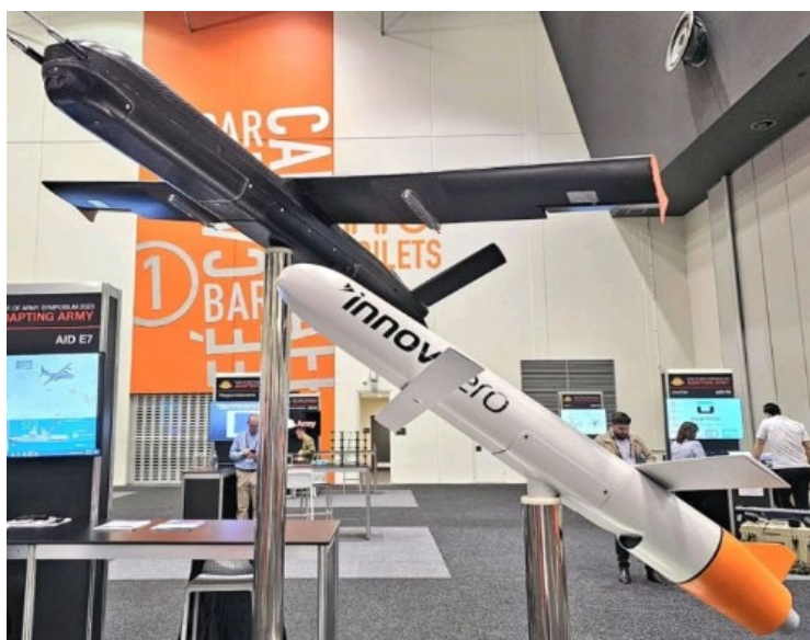
The OWL Unmanned Aerial Vehicle from Innovaero

Aurora Labs Limited ("A3D" or "the Company") (ASX:A3D), as a leader in industrial 3D printing in Australia, is pleased to announce that it has signed a Memorandum of Understanding (MoU) with Australian defence UAS developer, Innovaero Pty Ltd. This collaboration aims to leverage Innovaero's expertise in aerospace systems development and Aurora Labs' advanced 3D printing capabilities to innovate and enhance the manufacturing of metal UAS components and to supply Innovaero with Aurora Labs micro gas turbines for testing on Innovaero's current UAS platforms.