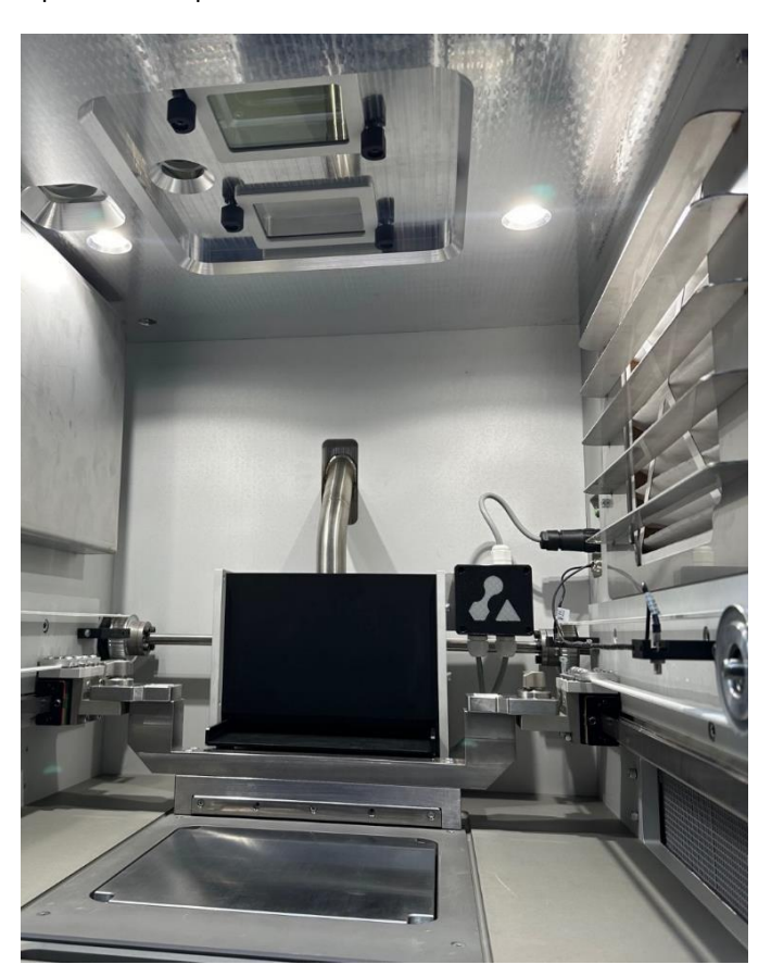
AL250 Printer Prepared for Aluminium Printing

A3D's efforts to broaden its micro gas turbine product line represent a significant step forward in supporting sovereign defence capabilities. The 400N and 800N engine sizes are particularly suited to next-generation UAVs and tactical air systems, providing enhanced operational capabilities and cost efficiencies for defence forces.