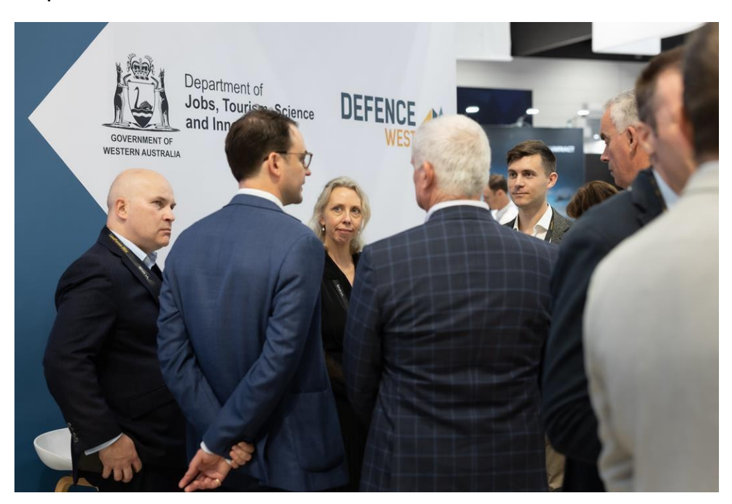
Attendees at the A3D Stand at LandForces Defence Conference