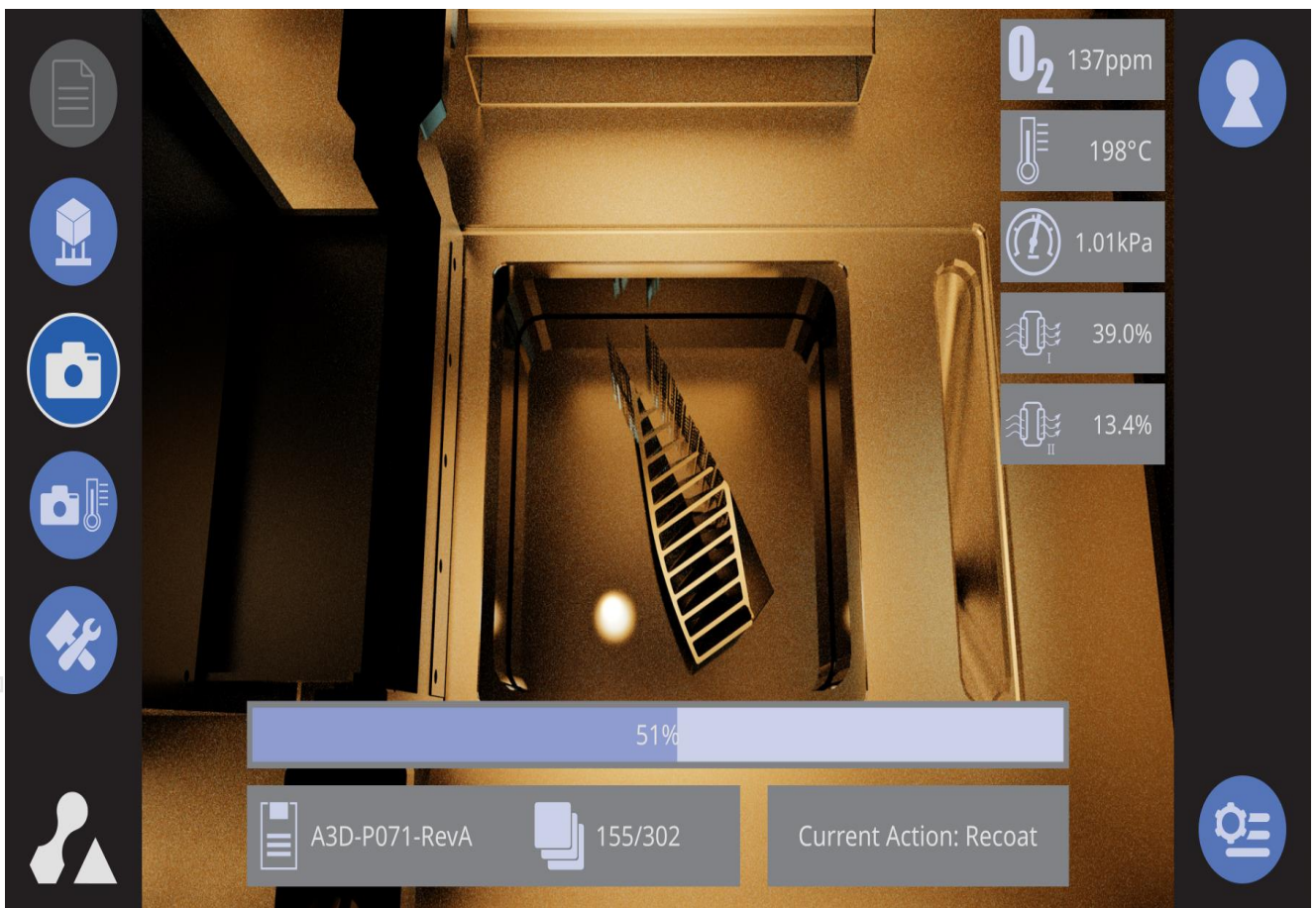
Figure 1: AL250 General User Interface showing internal build chamber (CONCEPT ONLY)

Our immediate focus in the quarter once the design completed, has now shifted towards the initial assembly of the machine frame. This phase will assess the fitment and configuration of parts, ensuring seamless operation. While our efforts to commercialise the printer and engage industry partners remain resolute, the manufacturing of the first sales units are contingent upon the procurement of sales orders. The first built machine will be fully deployed within our print services business to support our ongoing services expansion.