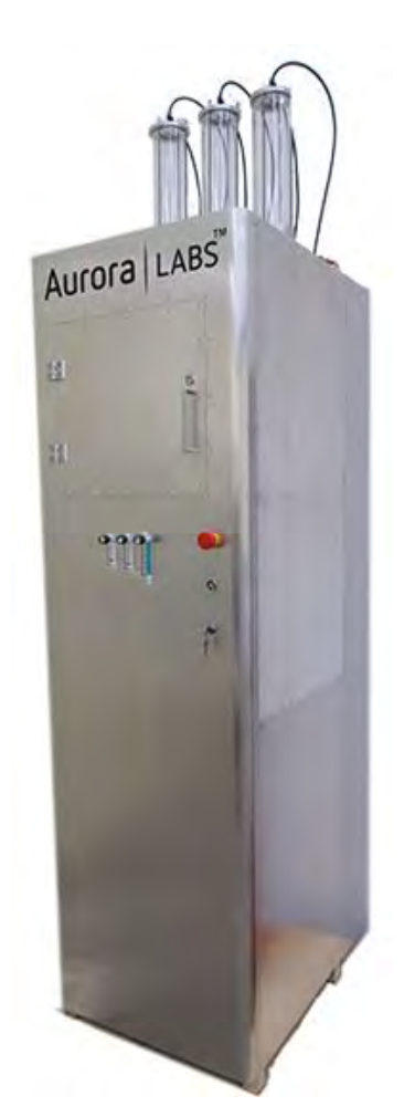
S-Titanium Pro beta machine