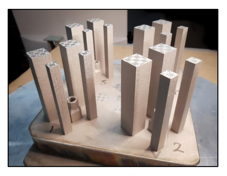
Fig 1: Tensile Bars printed at high laser power

Testing undertaken by a 3<sup>rd</sup> party NATA certified laboratory in accordance with appropriate powder bed fusion printing standards demonstrate compliance with the standards though achievement of as printed density greater than 99% and tensile properties in line with other commercially available powder bed fusion printers; the key difference is that this has been achieved at considerably higher laser power.